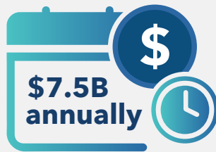
PRE-PANDEMIC REVENUE LOST TO UNCOLLECTED PATIENT PAYMENTS 2