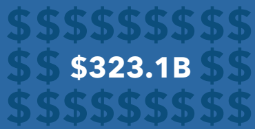
PROJECTED LOST HOSPITAL REVENUE IN 2020 FROM THE PANDEMIC 4